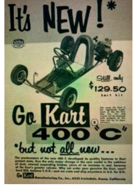
Above: 1960s ad